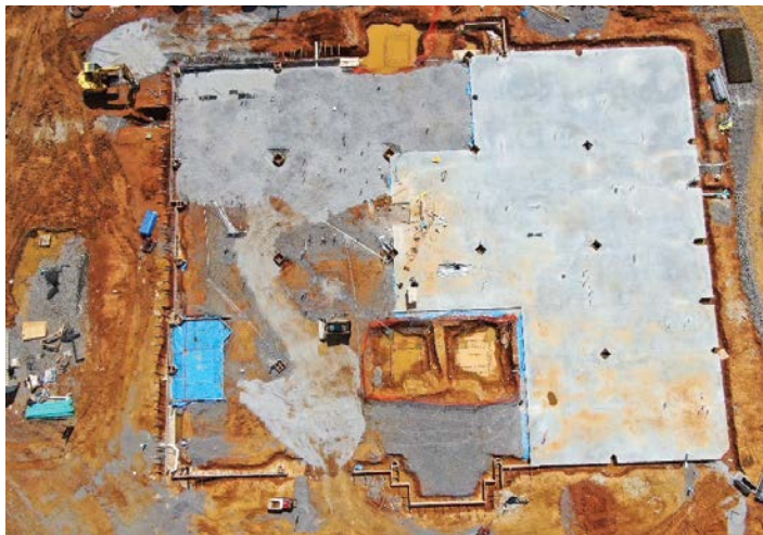
MMC's new medical office building is currently under construction.

PRSRT STD US Postage PAID Merrimack, NH Permit No. 20