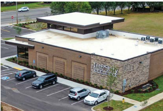
Integrity Eye Care — Murfreesboro, Tennessee