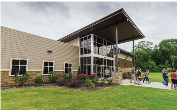
Fellowship Bible Church — Murfreesboro, Tennessee